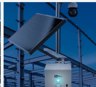
Strobe, Sirens & Talk Down Audio Alerts