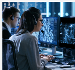
Rapid Threat Verification