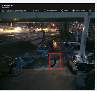
Smart Motion Detection