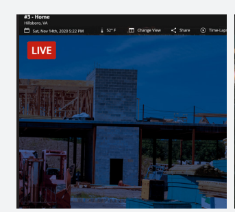
24/7 Jobsite Surveillance